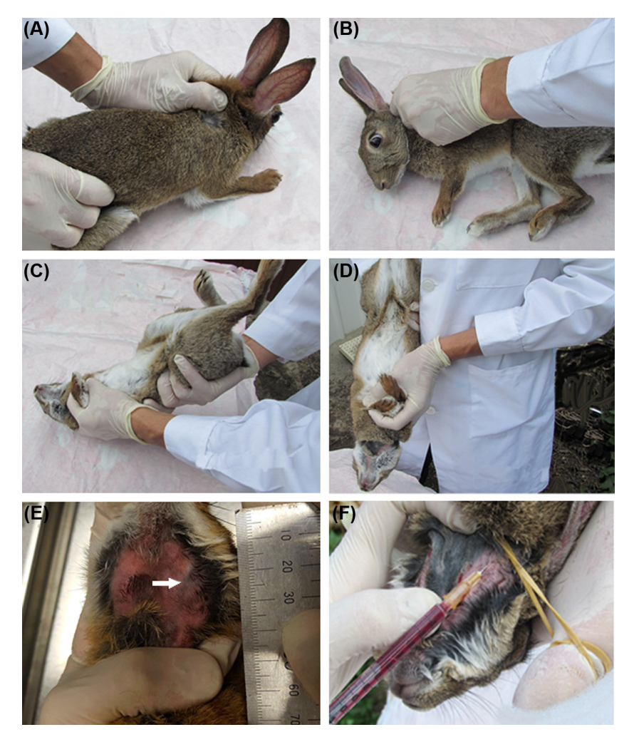
Figure 1. Sequence of procedures for containment and presentation of the animal for blood collection. First approach (A), lateral decubitus (B), dorsal decubitus (C), presentation of the animal for blood collection (D), visualization of external jugular vein (E) and blood collection (F). The arrow indicates the beginning of the external jugular vein. Cranially at this point are the linguofacial and retromandibular veins.

During handling, a small ear biopsy was obtained from a subset of the captured rabbits (n = 12) and kept in 96% ethanol until further analysis. Additionally, samples from five domestic rabbits were obtained for comparative purposes. Genomic DNA was extracted using the EZNA DNA purification kit (Omega) following the manufacturer's guidelines. Two molecular markers were amplified via PCR to infer the taxonomic status of the analysed rabbits: the mitochondrial control region and the first intron of the coagulation factor IX (F9) gene (X chromosome). Obtained sequences were compared with those published in public databases for subspecies inference. The details of the protocol are not revealed in this study because they are not within its scope.