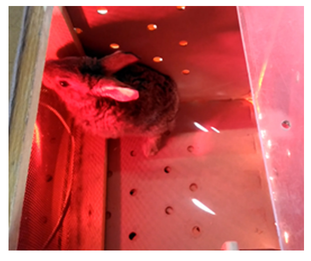
Figure 2. Recovery of body temperature in a box with infrared light heating regulated by thermostat.

fence. Extreme outliers were only found in the temperature measurement and were not removed due to small sample size and clustering. Values biologically non-logical (e.g. heart or